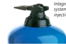
Integrated by-pass : system of turning concentrate injection on and off.

These options allow adapting your Dosatron to your needs. Contact our technical service to help determine what option you may need.